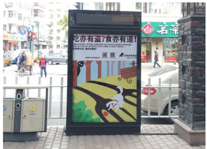
Advertisement displayed in Harbin city, Heilongjiang Province