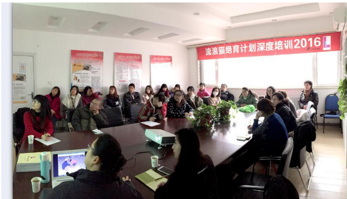
TNR in-depth training for Qingdao groups, February 2016

In 2016, Animals Asia continued to collaborate with Beijing Lucky Cat to conduct TNR in-depth training to five local groups in Qingdao and Ningbo, and provide guidance for their stray cat population control projects. In addition to the training, Animals Asia' s TNR fund project has directly helped 364 stray cats be successfully neutered and returned back into the communities in Shanghai, Beijing, Qingdao and Guangzhou. We also provided TNR guidance manuals and equipment to six groups to aid and develop their TNR projects.