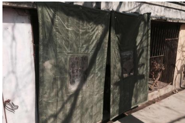
Shade for Shi Jiazhuang Public Security Bureau's government-run dog shelter