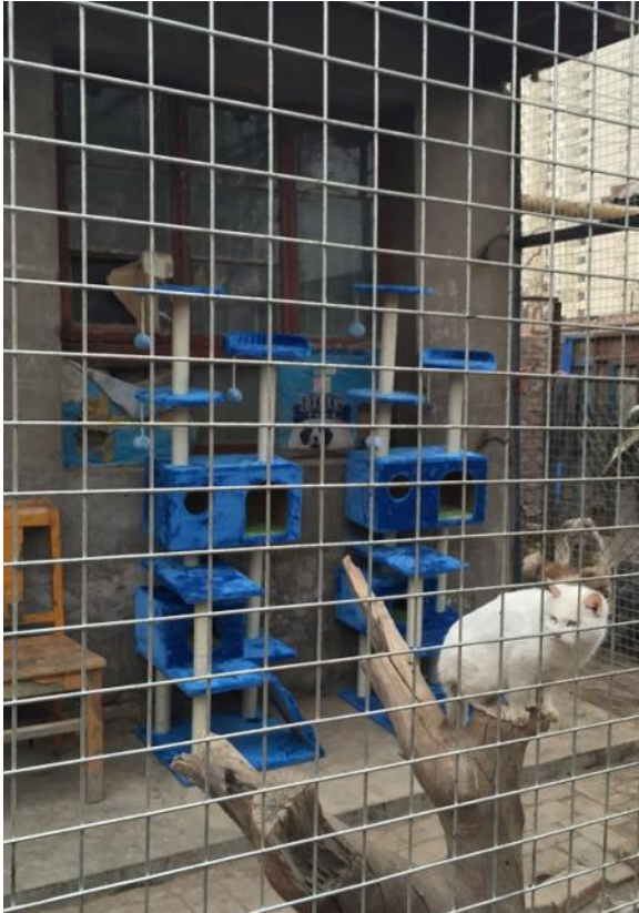
Lanzhou Stray Animal Protection Association's reconstructed cat shelter

In 2016, Animals Asia continued offering help to 12 organisations across China: over 5,200 animals have benefited from our support. We have donated medicine, vaccinations, food, cages, disinfectant and other commodities to shelters in need. We have also supported construction projects such as installing canopies, re-flooring muddy ground, replacing fences and rebuilding small animal houses.