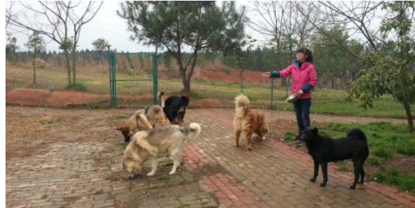
Nanchang Small Animal Protection Association's new flooring and fencing