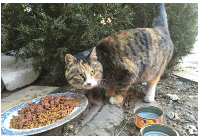
A survivor at Li Fenghua Cat Shelter after the fire

In 2016, we reached out to over 3,300 rescued animals by donating cat and dog food, vaccinations and disinfectants: 32 boxes of cat food were provided to Beijing Li Fenghua Cat Shelter after a fire partially destroyed their centre; 1,380 dogs received vaccinations donated to Sichuan Qiming Animal Protection Association and Shandong Taishan Small Animal Protection Association.