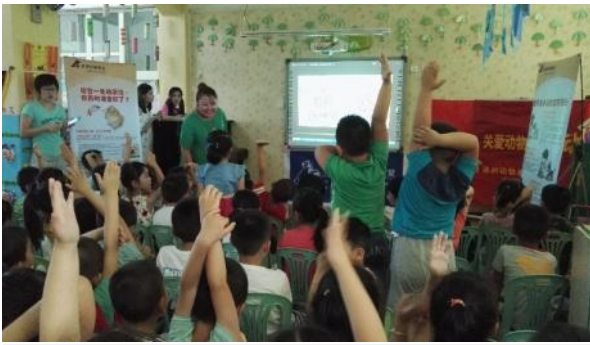
Kids in a Xi' an kindergarten watching 'Cat and Dog Welfare Around Us'