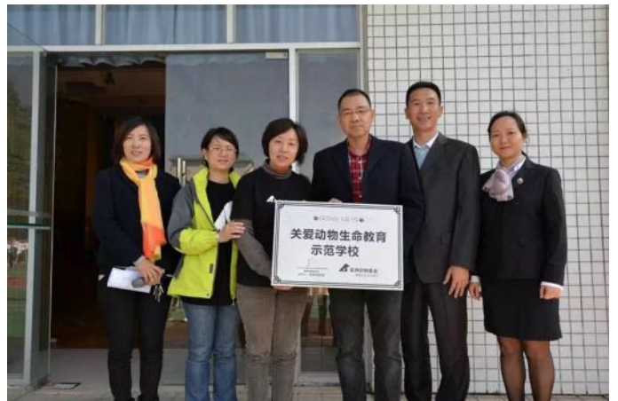
Presenting "Love Animal Care Life Education Model School" award to the headmaster of Shenzhen Beihuan Middle School