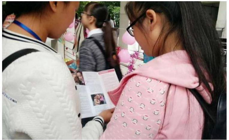
Students with Animals Asia leaflets in Southwest University of Finance and Economy Tianfu College, October 2016

By the end of December 2016, 38,985 brochures, 2,739 posters, 1,654 banners, DVDs, stickers and a further assortment of materials had been distributed to 208 organisations and individuals across the country to support their local public education campaigns, reaching over 430,000 people.