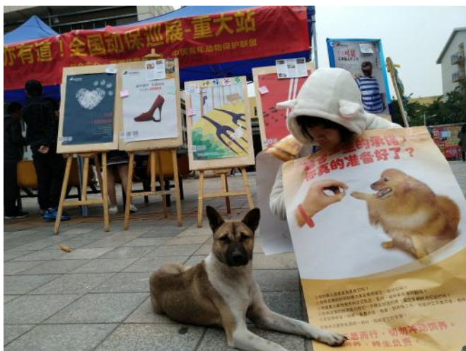
Poster exhibition tour in Chongqing University, Sichuan Province