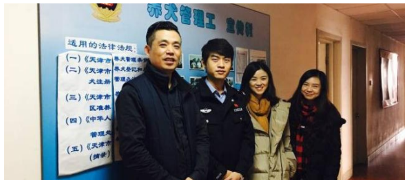
top: Visiting Hefei Canine Association Small Animal Care Center Below: With officers from Tianjin Dog Ownership Management Office