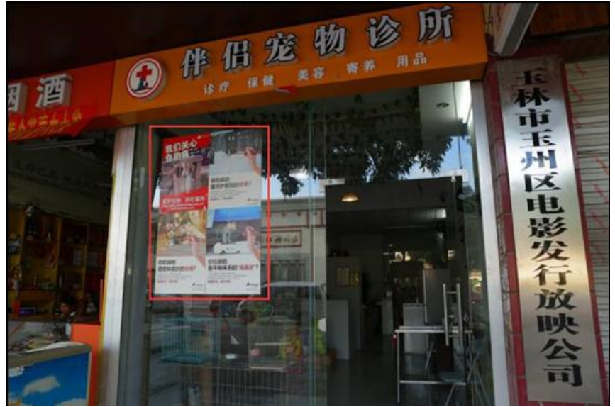
Our No to cat and dog meat poster prominently on display in a vet clinic, Yulin

We communicated with six Yulin departments including the Food and Drug Administration, Animal Husbandry and Veterinary Bureau and Public Security Bureau by phone, interview and letters, while submitting our reports and recommendations to them on the issues surrounding dog and cat meat consumption, asking for a ban on the industry. During the festival we provided free “Say NO to cat and dog meat” posters and materials to one school and two pet clinics in Yulin city.