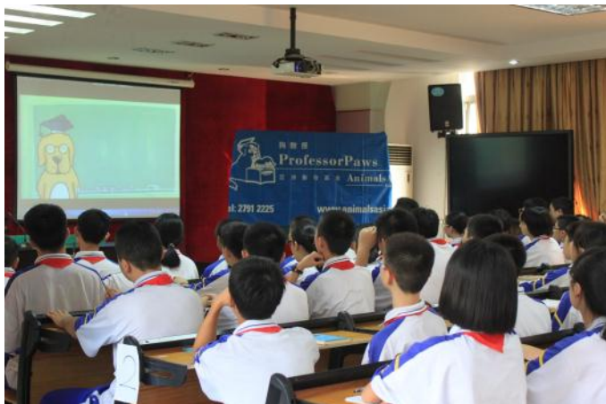
Students of Guangzhou No. 82 Middle School watching "Cat and Dog Welfare around Us"

Animals Asia' s "Cat and Dog Welfare Around Us" movie was played 132 times in 14 cities, where over 66,000 people learned about cat and dog welfare. In total, 53 organisations from across the country helped to spread the video to their audiences. Four grass-root NGOs and six schools were awarded as Animals Asia' s model partner for helping to raise awareness and knowledge of cat and dog welfare.